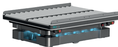
The TR1000 is optionally delivered with an automatic height adjustment solution, which gives the opportunity to collect and deliver in different heights.

Automated height adjustment from 600 mm/23.62 inches to 750 mm/29.52 inches.